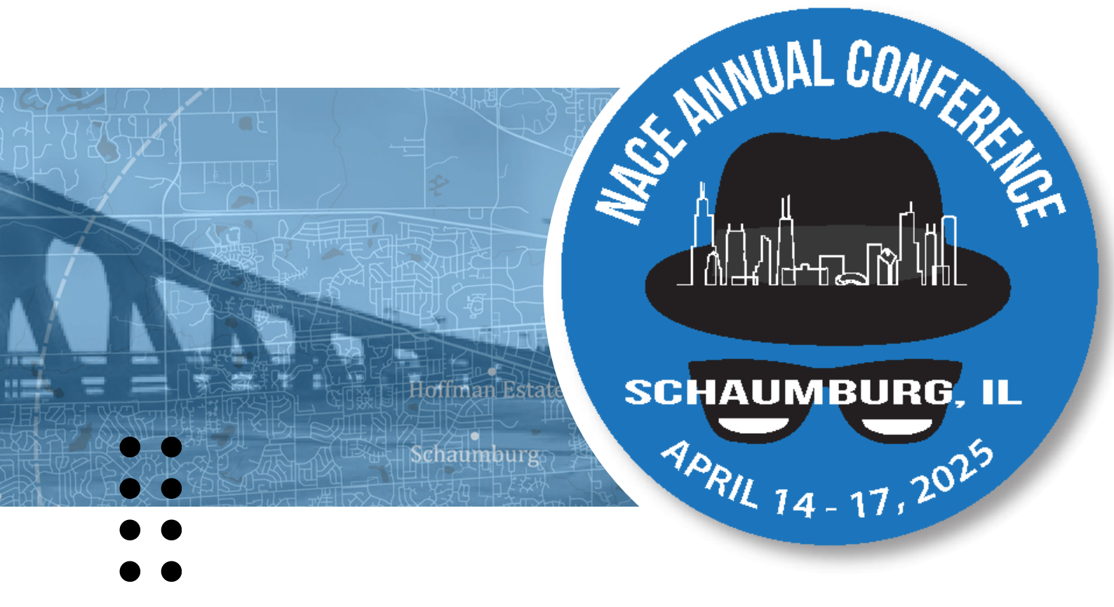
Exhibit & Sponsorship Information

Exhibit Show: Tuesday, April 14th & Wednesday, April 15th